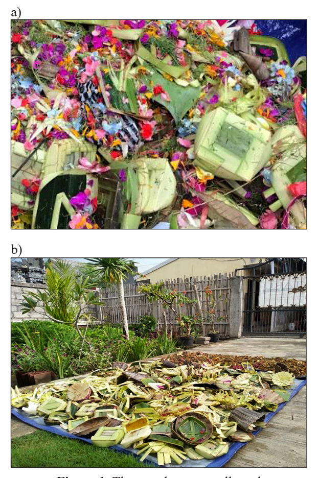
Figure 1. The temple waste collected from ceremonial activities

The temple waste characteristic that was measured included waste generation, waste composition and density. Then, the wastes were collected from the trash bins placed around the temple and weighed. Then the wastes were sorted into several categories, such as food waste, leaves, flowers, bulk waste, and inorganic waste. Each composition was weighed and compared to the total waste to obtain the composition percentage. The density